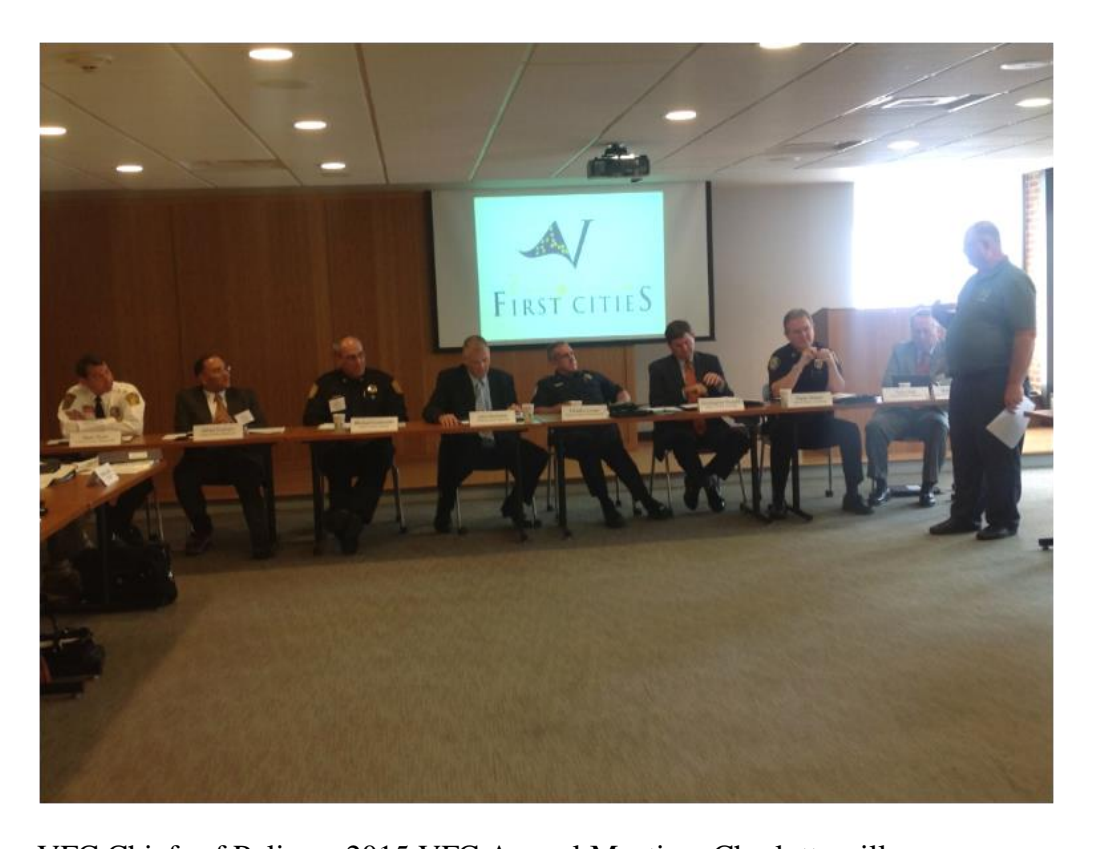
VFC Chiefs of Police – 2015 VFC Annual Meeting, Charlottesville